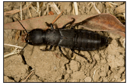
Figure 8. The devil's coach horse, Ocyopus olens , which is more than an inch long, is a predatory beetle that feeds on snails and slugs.

Some metaldehyde products are formulated with carbaryl, partly to increase the spectrum of pests controlled such as soil- and debris-dwelling insects, spiders, and sowbugs. However, carbaryl is toxic to earthworms and soil-inhabiting beneficial insects such as ground beetles, so it is better to avoid using snail baits containing carbaryl.