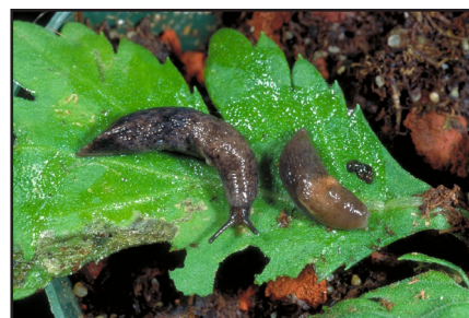
Figure 3. Gray garden slugs with chewing damage and slime trails on leaves.