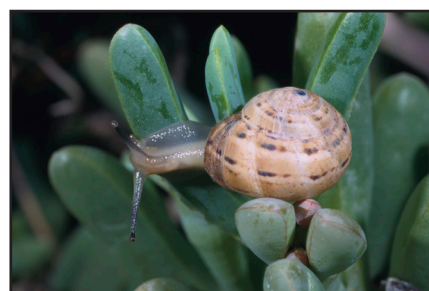
Figure 2. Adult white garden snail, Theba pisana .