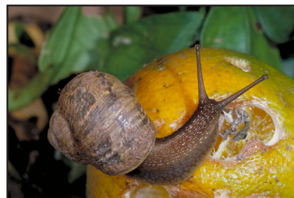
Figure 1. Brown garden snail.

A good snail and slug management program relies on a combination of methods. The first step is to eliminate, as much as possible, all places where they can hide during the day. Boards, stones, debris, weedy areas around tree trunks, leafy branches growing close to the ground, and dense ground covers such as ivy are