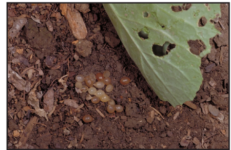
Figure 5. Snail eggs.

Some people use beer-baited traps buried at ground level to catch and drown slugs and snails that fall into them. Because it is the fermented part of the product that attracts these pests, you also can use a sugar-water and yeast mixture instead of beer. However, these traps aren't very effective for the labor involved. Beer traps attract slugs and snails within an area of only a few feet, and you must replenish the bait every few days to keep the level deep enough to drown the mollusks. Traps must have deep, vertical sides to keep the snails and slugs from crawling out and a top to reduce evaporation. You can purchase this type of snail and slug trap at garden supply stores.