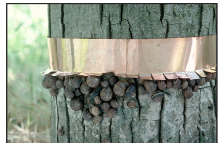
Figure 7. Copper barriers can keep snails and slugs out of trees and raised beds.