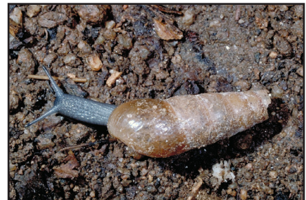
Figure 9. The decollate snail is a predator of snails.

Baits containing only metaldehyde are most reliable when temperatures are warm or during periods of lower humidity. When it is sunny or hot, these baits cause snails and slugs to die from desiccation or dehydration. The pests usually die with one day of ingesting the chemical or getting it on their foot. If cool, wet weather follows the baiting, they can recover if they ingest a sublethal dose. Don't water heavily for at least 3 or 4 days after bait placement, since watering will reduce effectiveness. Most metaldehyde baits break down rapidly when exposed to sunlight and high irrigation; however, some paste or bullet formulations (e.g. Deadline) hold up somewhat longer in these conditions.