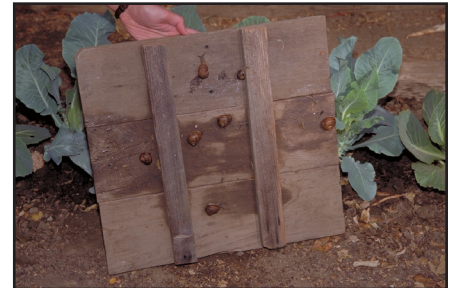
Figure 6. This turned over board trap reveals snails on its underside.