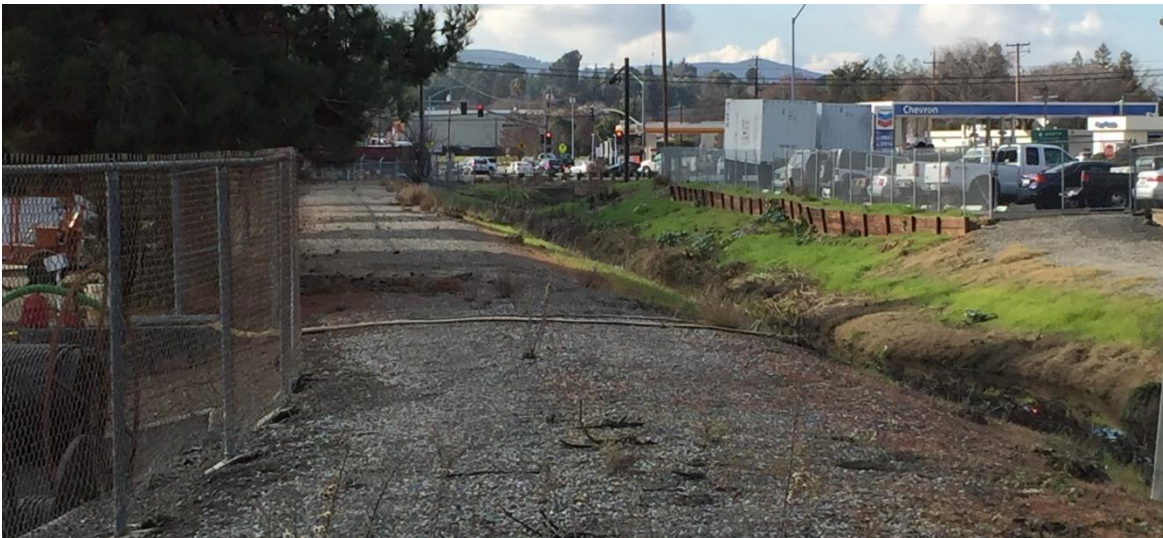
Discharging from Parking Lot; with Erosion