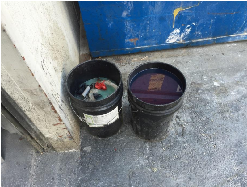
Spillage from Material Handling